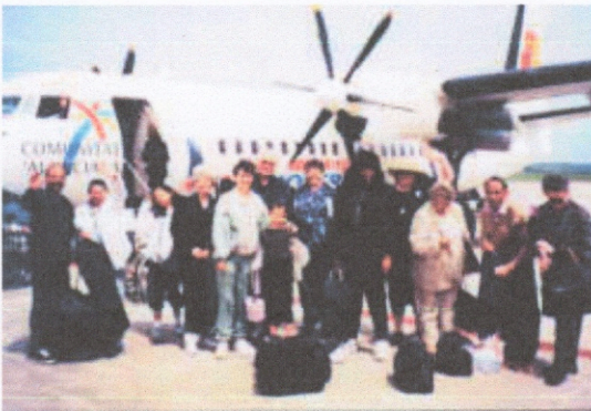
May 10, 1999 ~Depart for Garabandal. We arrive at Santander Airport.

May 10,1999 ~ arrival in San Sebastian de Garabandal, Spain. Lodgings in the village, all meals included.