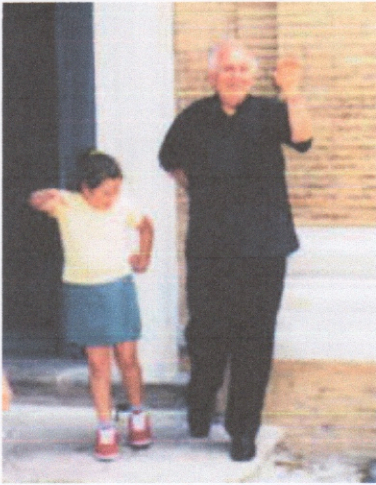
There was also time for play.