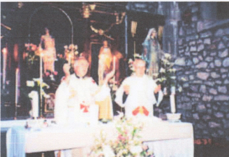
May 12, 1999 ~ Excursion to Santo Toribio Monastery which houses the largest known piece of the True Cross. A moment to remember and to venerate the true cross!

May 11, 1999 ~ Daily Mass, Rosary, Stations of the Cross. Tour of Village. Mass was celebrated by Bishop Roman along with other priests daily in the village church.