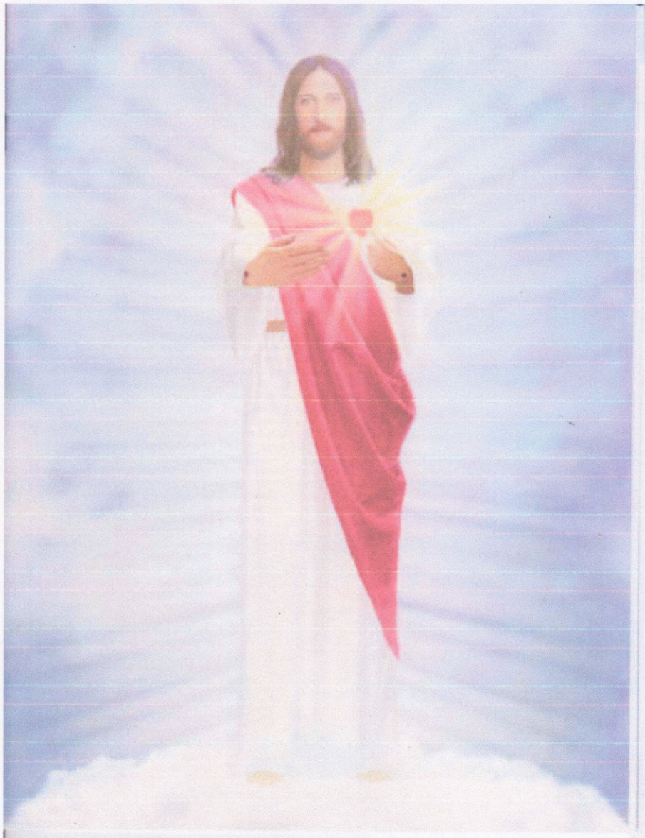
PHOTO: artist's depiction of Jacinta's vision.